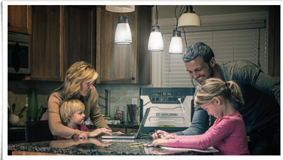
Power Your Emergency