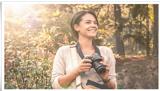
Power Your Life