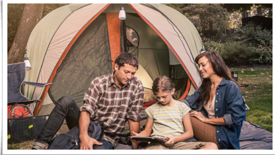
Power Your Camp